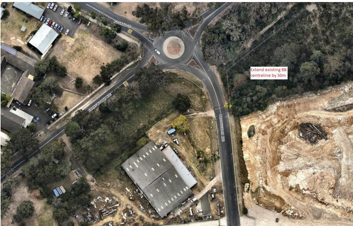
Production Avenue south of Farnsworth Avenue Junction