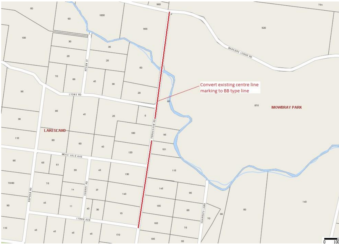
Convert existing centre line to BB type line from Barkers Lodge Road to Lynne Avenue