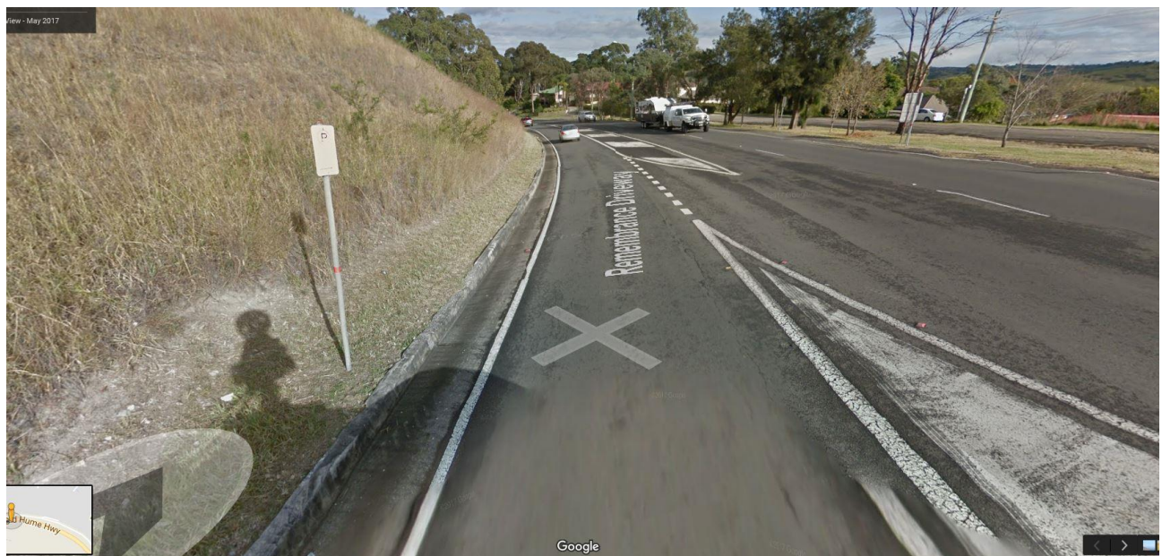
Looking south at the start of the existing "No Parking" (R5-40) zone