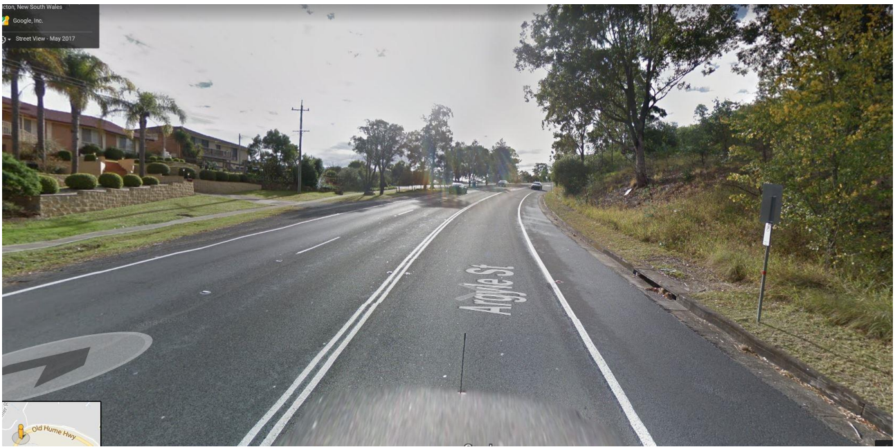
Looking north at the end of the existing "No Parking" (R5-40) zone