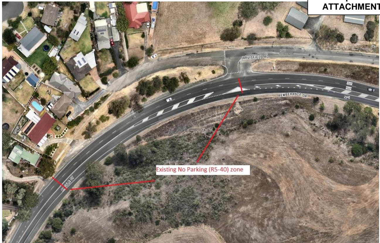
The extent of the existing "No Parking" (R5-40) zone