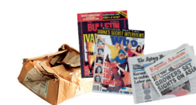
Paper and Cardboard