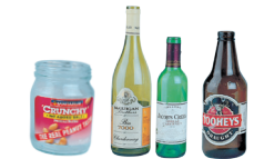
Glass Bottles and Jars (colours must be kept separate)