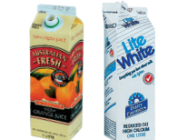
Milk and Juice Cartons