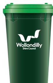
240L Garden Organics Bin