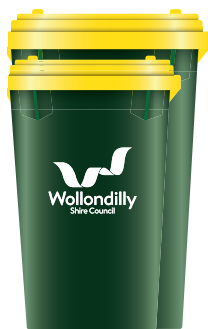
240L, 360L Recycling Bin