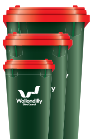
80L, 120L, 240L General Waste Bin

Wollondilly Shire Council provides customers in the collection areas with the choice of an 80 litre, 120 litre or 240 litre general waste bin (weekly collection), and all residents a choice of a 240 litre or 360 litre yellow lidded recycling bin (fortnightly collection). Some customers receive a 240 litre garden organics bin (fortnightly collection). Wollondilly Shire Council also offers residents two (2) 1.5m 3 clean up collections each year.