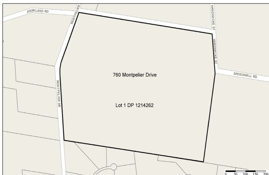
LOCATION MAP ↑ N