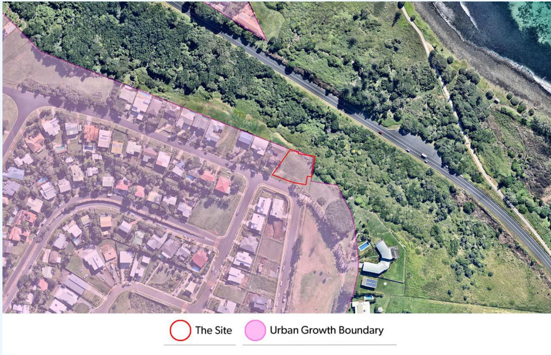
Figure 4. Confirming that a site sits inside an urban growth boundary under a regional plan.

Mapping may be provided to confirm that a proposal will give effect to directions, planning priorities or actions under a regional/district plan.