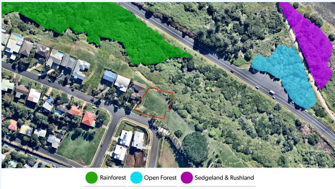
Figure 6. Identifying known native vegetation communities surrounding a site.

Mapping may be provided under an initial planning proposal to identify known vegetation communities that are located within or near the site.