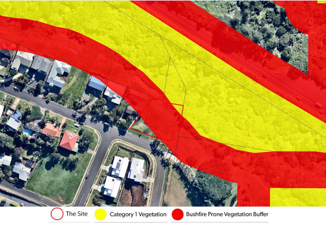
Figure 8. Identifying if a site is located near mapped bushfire threat.

Imagery may be provided under an initial planning proposal to confirm if the land is mapped as being subject to natural hazards