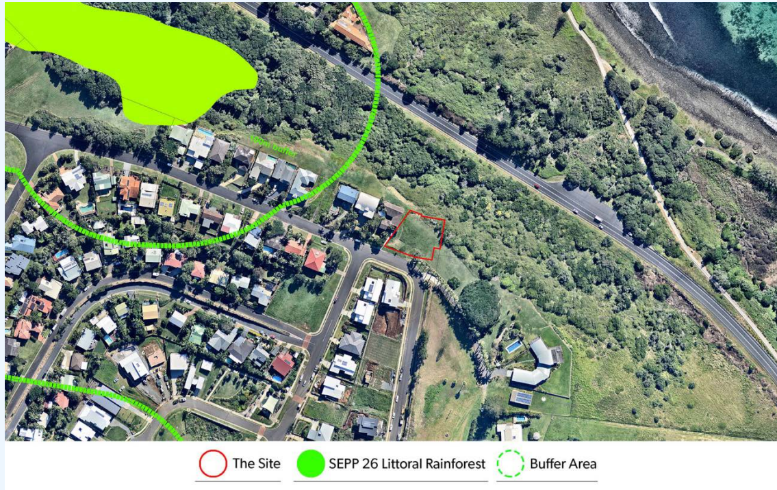
Figure 5. Confirming that the provisions of State Environmental Planning Policy 26 – Littoral Rainforests do not apply to a site.

Mapping may be provided under an initial planning proposal to identify if a SEPP is relevant to the proposal.