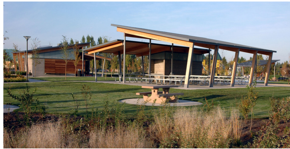
McMinnville Park Shelters, Oregon USA