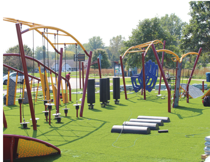
Ninja Warrior Style Fitness Equipment