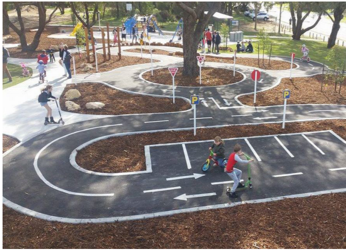
Shepherds Bush Park, Kingsley Perth WA