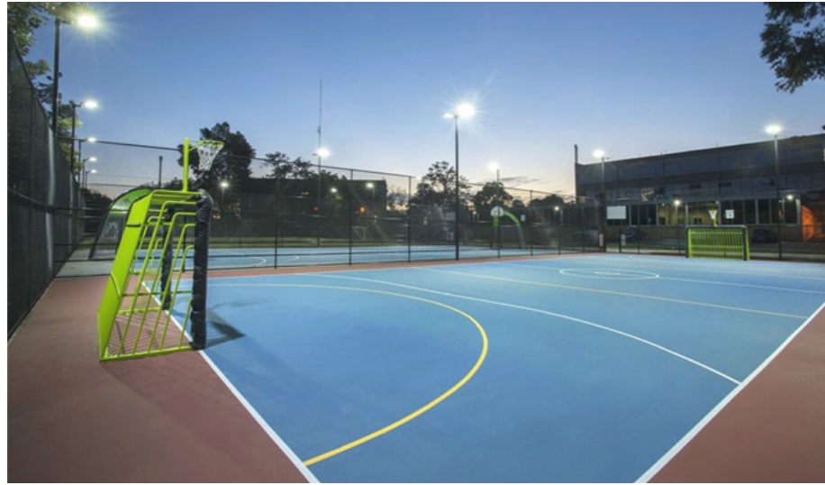
Multi-purpose court acrylic surface