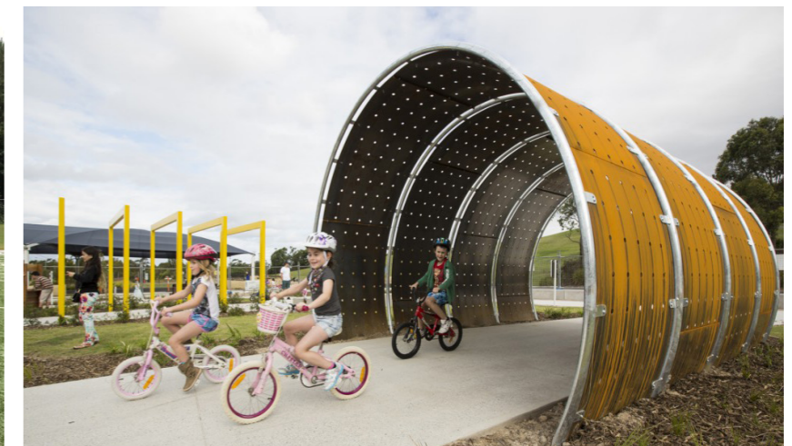
Childrens Bike track Sydney Park, NSW