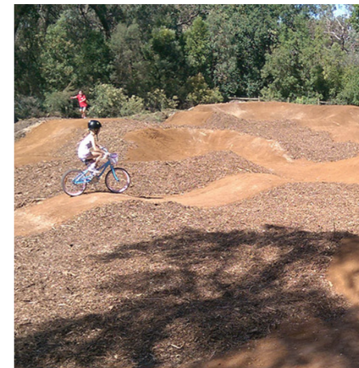
Children's BMX style track