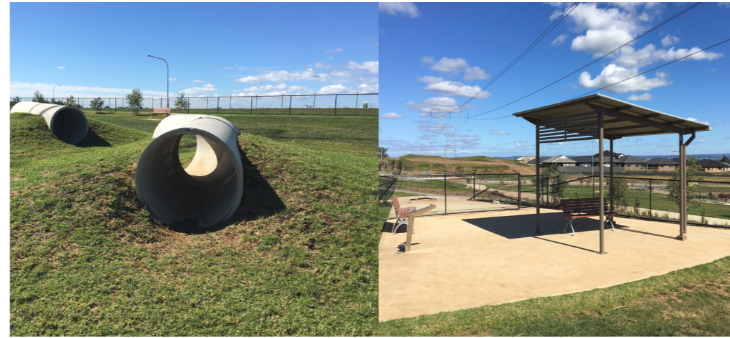
Gregory Hills Dog Park Facilities