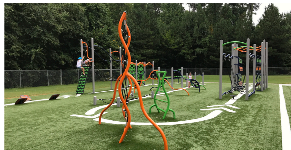
Elevate Fitness Outdoor Ninja Warrior course