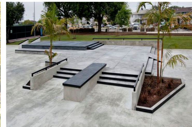
Westchester Skate Plaza, Los Angeles USA