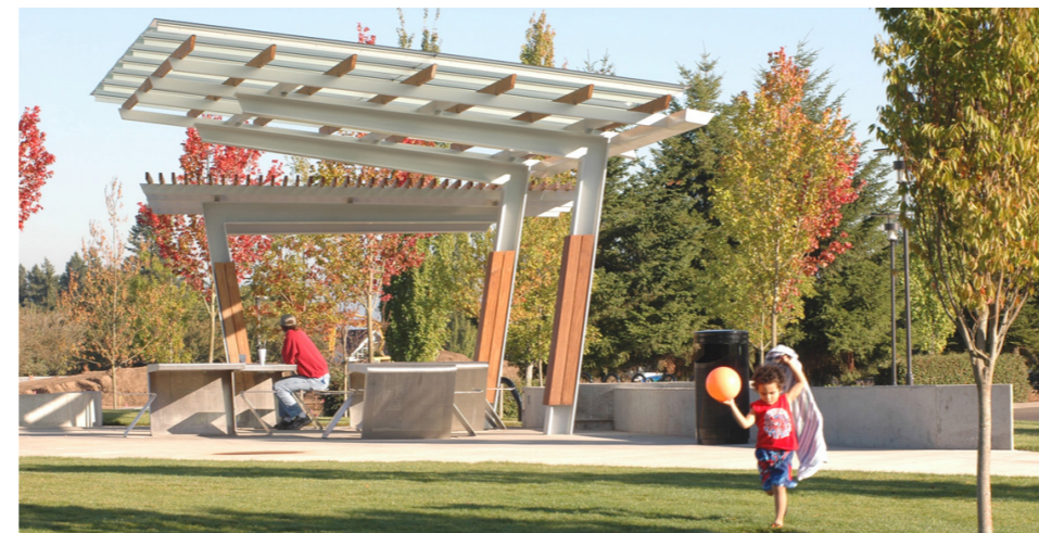
Wilsonville Park Shelters, Oregon USA