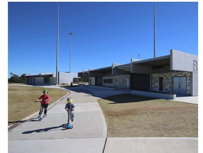
Pathway connection and Amenities building