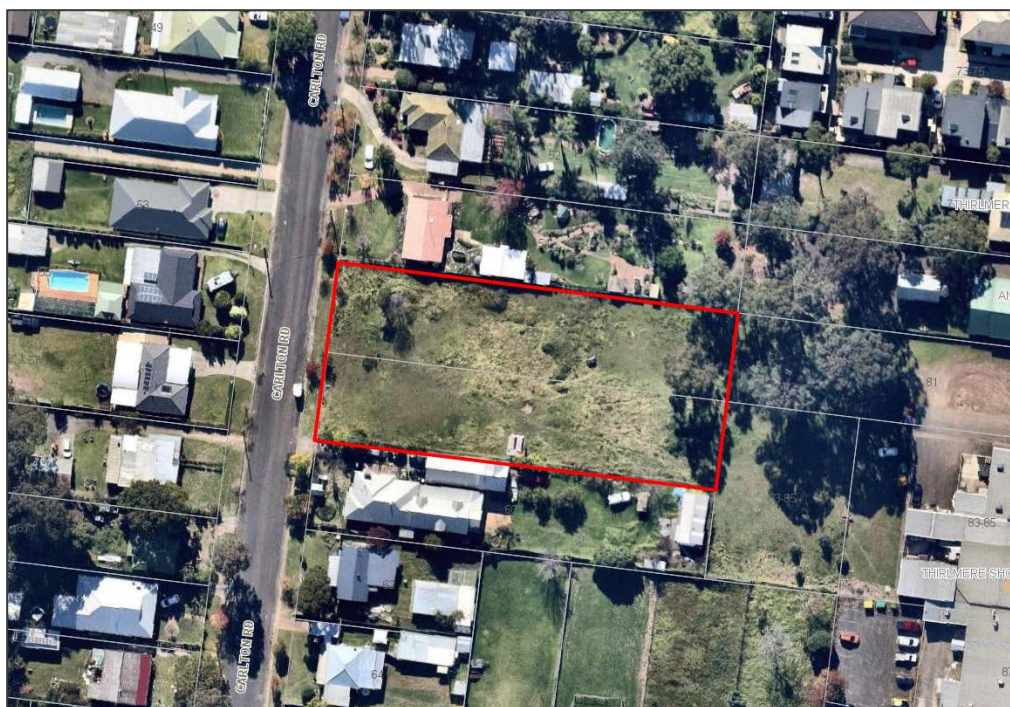
Figure 1. Aerial Imagery (Source - NearMap 28 May 2017)

The subject land is described as Lots 69 and 70, Section C, DP 1569, 56 and 58 Carlton Road, Thirlmere. The site is rectangular in shape, has an area of 3,642m 2 . The western boundary has a 40.23m frontage to Carlton Road.