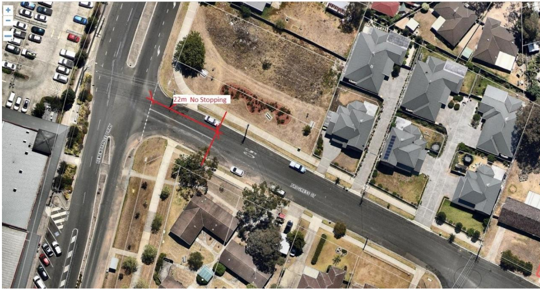
Site Map of the proposed “No Stopping” zone (R5-400).