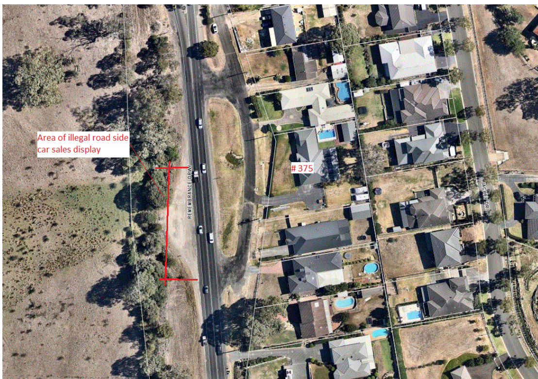
Locality aerial view

P O Box 21 PICTON NSW 2571 62-64 Menangle Street PICTON NSW 2571 Phone: 02 4677 1100 Fax: 02 4677 2339 Email: council@wollondilly.nsw.gov.au