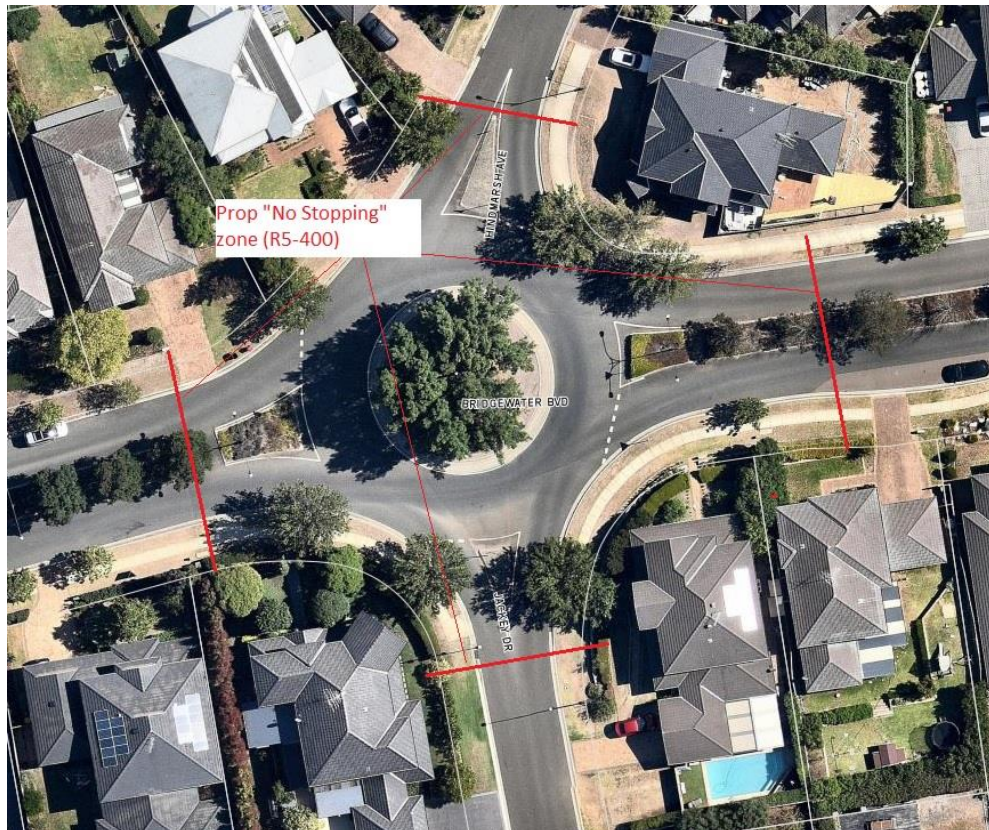
Site Map of the proposed “No Stopping” zone (R5-400)

P O Box 21 PICTON NSW 2571 62-64 Menangle Street PICTON NSW 2571 Phone: 02 4677 1100 Fax: 02 4677 2339 Email: council@wollondilly.nsw.gov.au