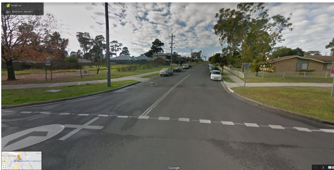
Looking east into Progress St from Remembrance Driveway

P O Box 21 PICTON NSW 2571 62-64 Menangle Street PICTON NSW 2571 Phone: 02 4677 1100 Fax: 02 4677 2339 Email: council@wollondilly.nsw.gov.au