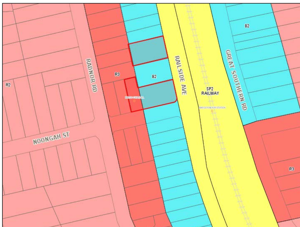
↑ LOCATION MAP N