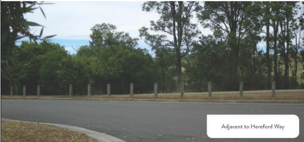
Adjacent to Hereford Way