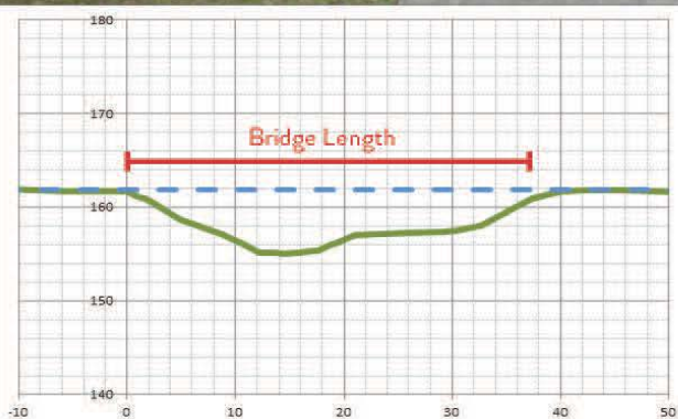
Creek Cross section with 100 year flood level