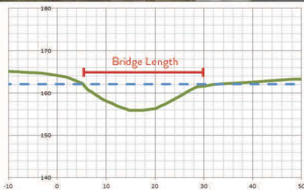
Creek Cross section with 100 year flood level