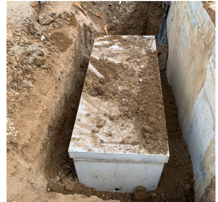
Slab on Ground to Back of House Area, Level 2 Slab, Waterproofing, Grease Arrestor