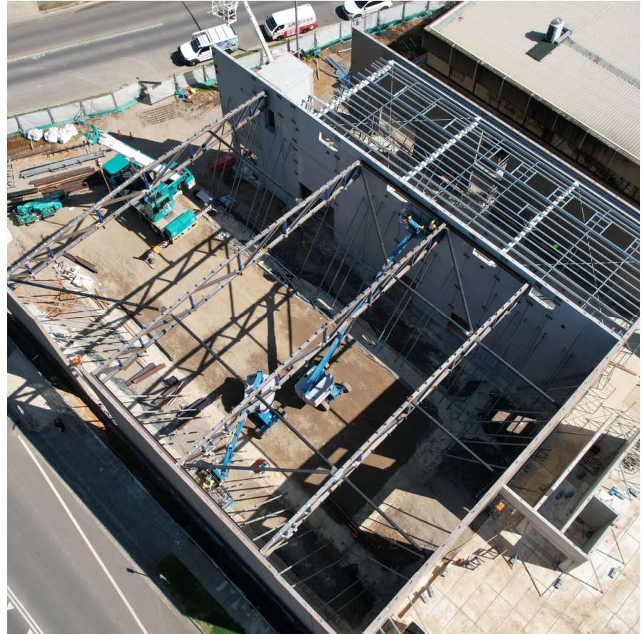
Overall Wollondilly Performing Arts Centre Site at end of August