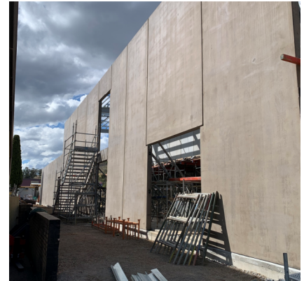
Precast Panels & Structural Steel